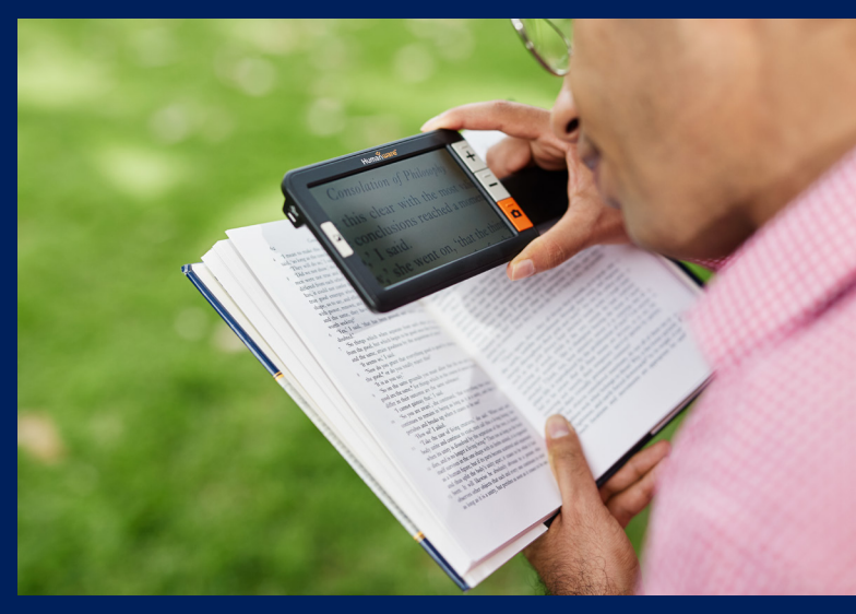
A magnifer being used to read a book in small print.